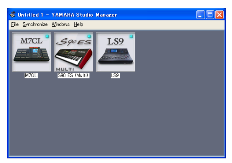
Studio Manager window

In the Studio Manager window, double-click the icon for each editor.